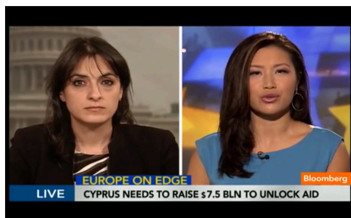
Bloomberg on the Cyprus deposits haircuts