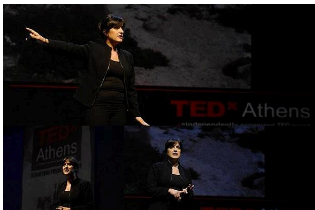
"Starting from scratch" Tedx