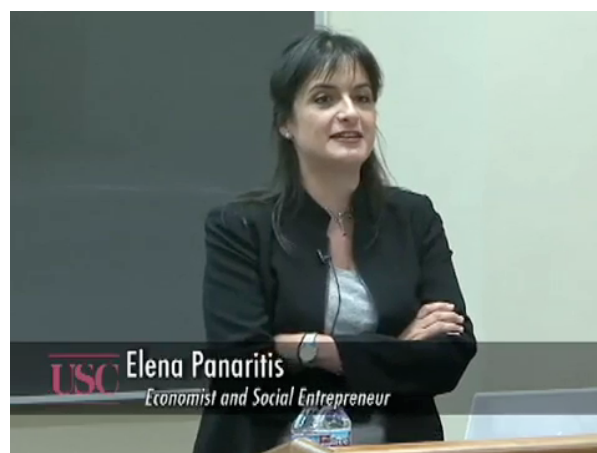
Prosperity Unbound book presentation